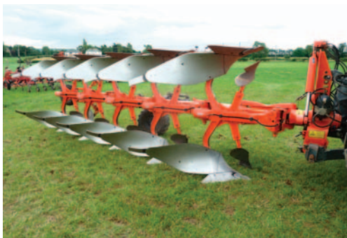
2005 Kuhn Vari-Master 151 4EH plough, five furrow, reversible, hydraulic vari width, hydraulic front furrow, hydraulic auto reset, depth wheel, transport wheel, 105cm point to point clearance, rear disc, s.no 13730.