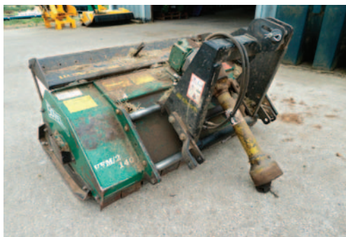
Sovema VFM/2140 flail toppler, 1.4m, hydraulic side shift, rear roller, s.no 91862.