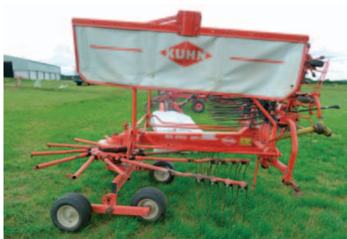
1998 Kuhn GA 4311 GM rake, single rotor, s.no AO313.