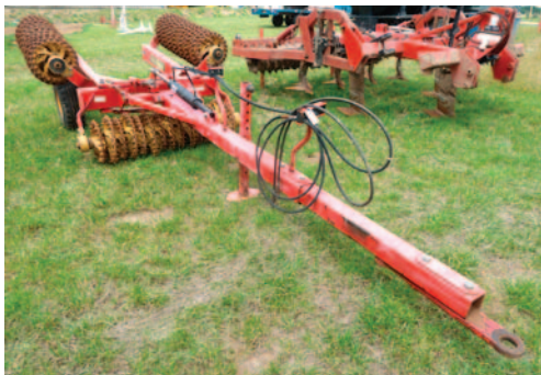
Vaderstad Rollex 450 press, 4.5m working width, 2.3m travel width, hydraulic folding, s.no B986B.