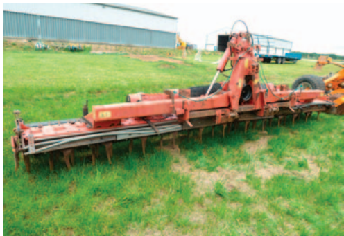
1995 Greenland/Feraboli Dublo T600 power harrow, 6m, hydraulic folding, tooth packer, s.no 11000852.