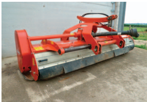
2010 Kuhn BPR 305 flail toppler, front and rear mount, hydraulic side shift, s.no 100216.