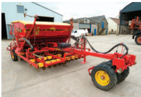
2007 Vaderstad Rapid 300 S Super XL drill, 3m, s.no D3328D, c/w Vaderstad MPP packer, s.no 6534.