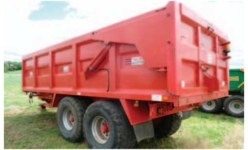
2006 AS Marston grain trailer, 16 tonne, tandem axle, high speed, hydraulic tipping, hydraulic rear door, air over hydraulic brakes, sprung drawbar, grain chute, Nokian Country King Flotation tyres 580/65R22.5, s.no 212939.