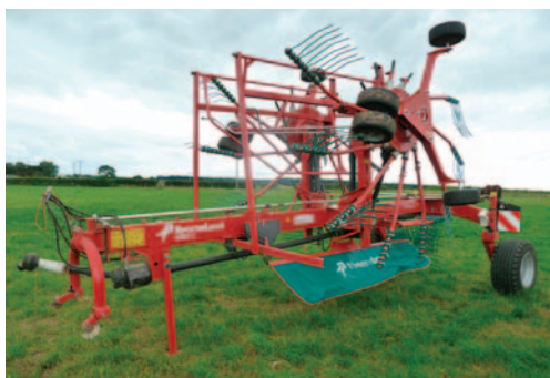
2017 Kverneland 9580 C rake, twin rotor, Terralink Quattro Ground Contour Following System, 7-8m vari-width, hydraulic width adjustment, hydraulic folding, s.no VF69720197.