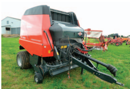
2015 Kuhn VB 2160 progressive density round baler, variable chamber, 2.2m pickup reel, ISOBUS compatible, chopper, air tank, baler control box, s.no VGRK007854.