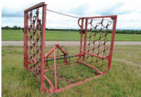
2013 Jarmet U810 chain harrows, 6m, hydraulic folding.