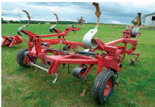
Kongsilde Vibro Flex 4300 cultivator, 4.3m, 17 tines, rear rototines, depth wheels, hydraulic folding, refurbished in 2012.