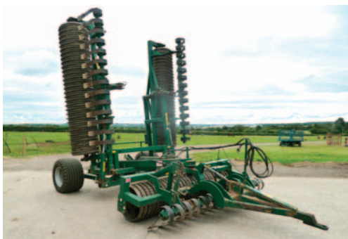
2008 Cousins Contour Cambridge rolls, 8.3m, articulated, hydraulic levelling boards, hydraulic folding, 24in breaker rings, s.no 2008186.