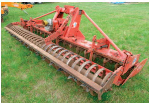
Lely Roterra 400-44X power harrow, 4m, flexi coil press, s.no 9650501.