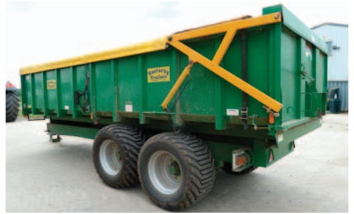
2000 Easterby ET12 root trailer, 12 tonne, tandem axle, hydraulic tipping, hydraulic rear door, hydraulic brakes, sprung drawbar, rollover sheet, grain chute, BKT Flotation 648 tyres 550/45R22.5, s.no 3490.