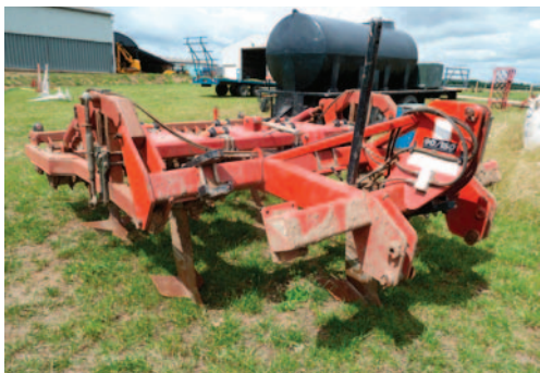
Spaldings 90/150 Subsurface Cultivator , three leg, seven Flatlift/Bellota auto reset tines, c/w Spaldings 2288 packer, hydraulic controlled, s.no 16072906.