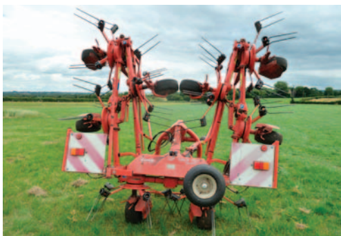
2008 Kuhn GF 7601 MH Digidrive tedder, eight rotors, 7.6m working width, s.no C1300.