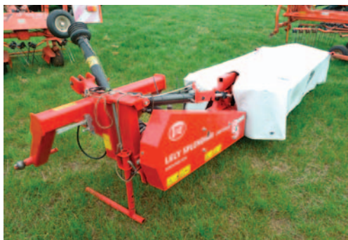
2013 Lely Splendimo 240 Classic disc mower, 2.4m, s.no 0003164039-2013.