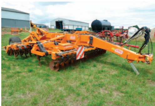
2011 Simba Great Plains SL400 cultivator, 4m, disc/tine/disc configuration, DD press, hydraulic brakes, rear draw bar and hydraulic piping, s.no 5240000484.