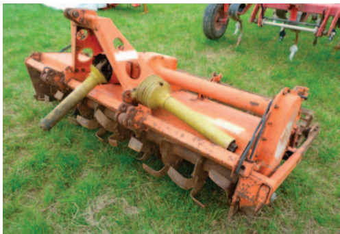
Howard HR30 rotavator, 2.14m, rear roller, depth wheel, s.no 030A10466.