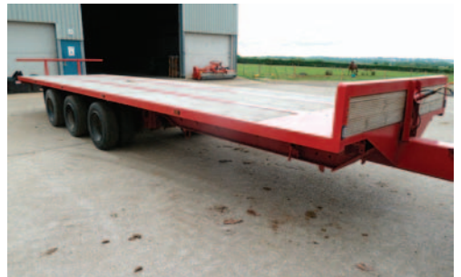
2009 Warwick flatbed trailer, 25ft, tandem axle, steel floor, hydraulic brakes, gormer, flotation tyres, s.no1091123.